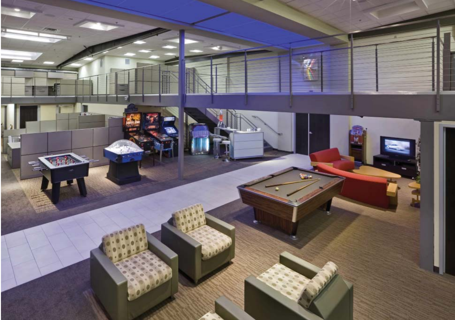
BELOW: Iumaside ceiling spline illuminated by continuous skylight (daytime) and RGB LEDs programmed for multiple light shows travels the entire length of the central corridor. Metal halide monopoints within skylights to the side provide task lighting below at seating groups and gaming areas. a colorful and shadowed art sculpture provides visible focus from front door.