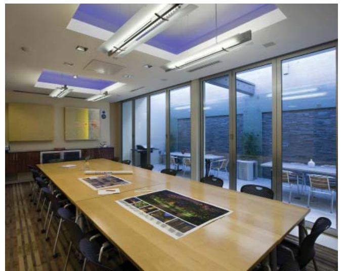
LEFT: color changing LED cove lights, direct/indirect fluorescent pendants, MR-16 downlights and compact fluorescent wall washers all dim separately providing the conference room with multi-scene presets. Interactive touch screen operates A/V equipment and drapes providing users with one-touch scenes for any occasion.