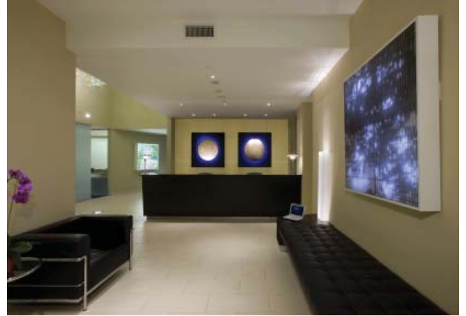
TOP: general illumination, task and accent lighting within the reception area is all provided by 20-watt ceramic metal halide trimless pinhole downlights. additional artwork internally illuminated by dynamic LEDs and cantilevered leather bench floats between supporting end tables that wrap around floor mounted lamps.

All lamps sources throughout the building were selected for long lamp life and high efficiency for reduced maintenance and wattage. Photocells, occupancy sensors, an astronomical timeclock and local controls at each work station provide full building control to suit the needs of each employee. Every light source applicable was dimmed to allow for minimal energy use while still achieving each visual task necessary.