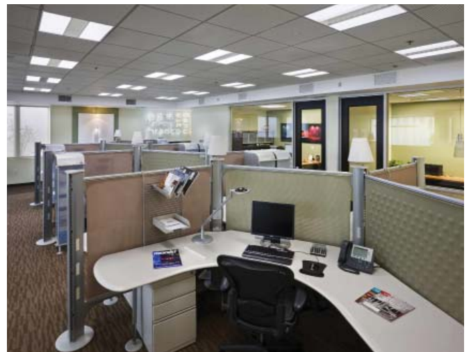
BOTTOM: daylight and fluorescent hybrid 2X2 troffers dynamically dim with the presence of daylight. Daylight is guided down from the roof to the translucent side panels and linear fluorescent lamps behind louvers energize when needed. workstations utilize integrated occupancy sensors and manual dimmer overrides allowing employees to control the workspace as needed. an educational neon sculpture interactively displays 12 colors of white, in 12 different languages, showing that white is not just one color.