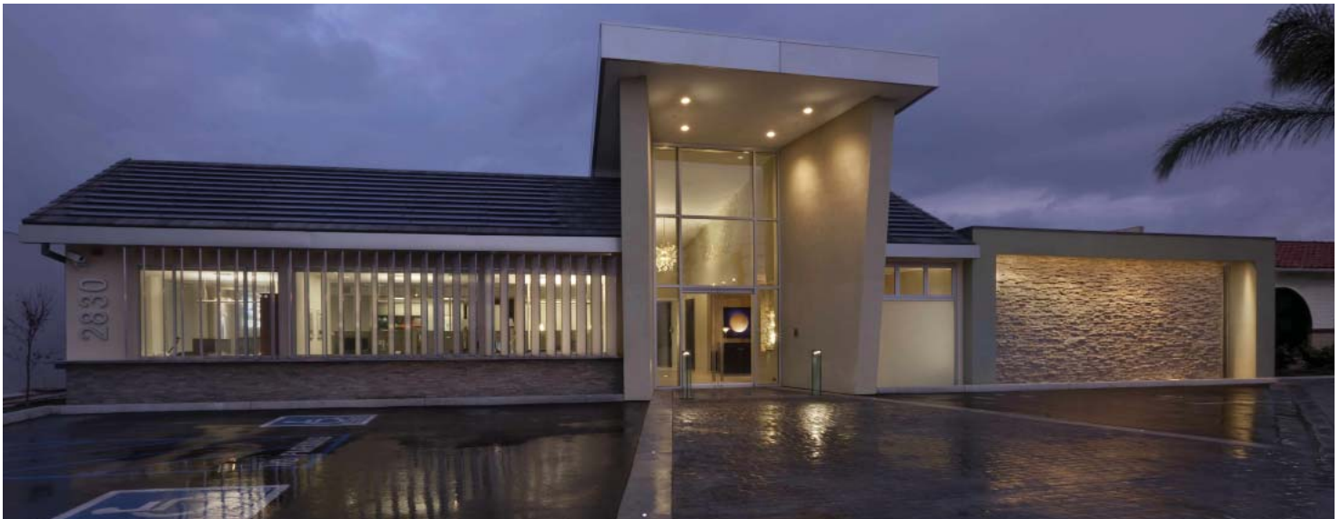
BOTTOM: embedded white LEDs and large suspended glass sculpture lead guests toward the front door while metal halide downlights and indirect glass bollards illuminate the entrance. linear LED light bars graze down the textured stone wall and indirect task lights within the offices create secondary focal planes.